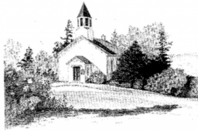
Harbourville United Church

This exhibit is a result of extensive research of property deeds, census records and so on and features 20 of Harbourville's heritage buildings.