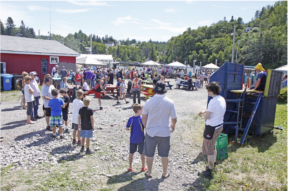
Crowds enjoying the Harbourville High Tide Festival

WE VALUE YOUR BUSINESS and TAKE PRIDE IN OURS